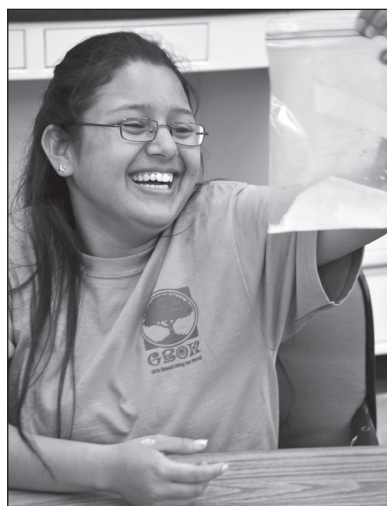
A GROW student is surprised by how fast crystallization occurs from a supersaturated sodium acetate solution after a seed crystal is added.

Keith Hohn led a track where students synthesized biofuels. First, they made biodiesel from used cooking oil, a process that required them to titrate free fatty acids in the vegetable oil, synthesize the strong base catalyst, react methanol with