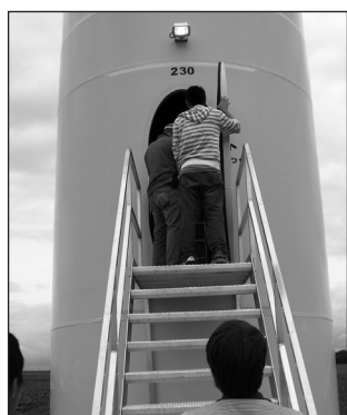
Above: REU students look inside a wind turbine.