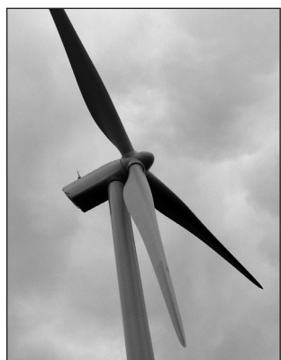
Below: Wind turbine at Meridian Way wind farm.

Land Institute in Salina, which studies sustainable agriculture, the Meridian Way Wind Farm just south of Concordia, the Jeffries Energy Center, the nuclear reactor at K-State and local organizations involved in developing new technologies.