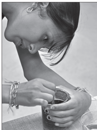
A supersaturated Borax-water solution is prepared.

workshop. As part of this workshop, participants are engaged in hands-on activities such as crystal growth that James Edgar has run for the past two years. In this activity, some of the common features that define crystals, such as symmetry and facets, and some of the applications for crystals—computer chips and lasers in DVD players—are studied. Students also grow Borax crystals and observe how nucleation is important for precipitation.