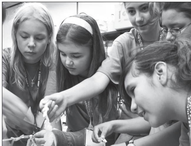
Girls in the GROW program rush to look at their borax crystals after a night of crystal growth.

Students in Berry’s track developed their own humidity sensors and learned about nanotechnology. On the first day, they were introduced to nanotechnology and the track activities. Sensor fabrication was performed on day two and day three. Here, the students spun polyelectrolyte fibers between gold electrodes on a pre-patterned silicon chip, followed by gold nanoparticles deposition on the fiber. This device, which works as a humidity sensor, was examined by students for response to dry nitrogen on day four. The students kept the