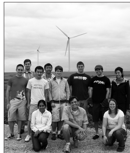
REU students visit the Meridian Way wind farm.