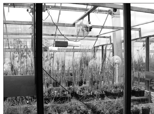
Greenhouse used to grow perennial versions of common crops at the Land Institute.